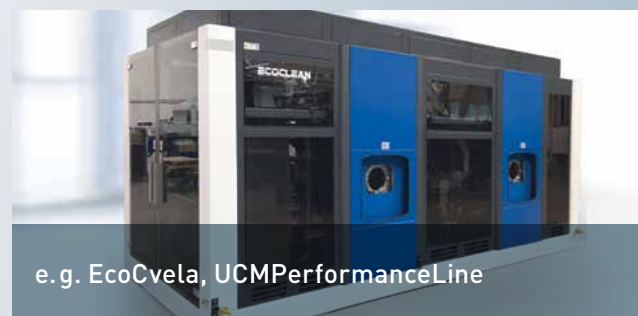
e.g. EcoCvela, UCMPerformanceLine

➤ Chamber cleaning/Inline immersion system