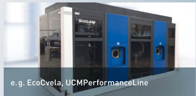
e.g. EcoCvela, UCMPerformanceLine

Chamber cleaning/Inline immersion system